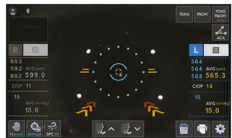
Auto Tracking Guide / User Friendly Interface