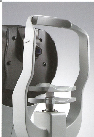
Motorized Chin Rest