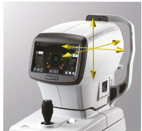
3D Driving Mechanism for Auto Focusing